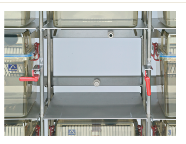
Empty CU: Illustrates how a rack is sealed from the room: Rack mounted sealing intake and exhaust ports sealing rack from the room when cages are removed.

and exhaust ports. Furthermore, a system to regularly confirm the integrity of these seals, such as a check station, is a wise option.