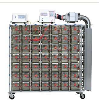
BCU Rack: Illustrates a Biocontainment rack configuration, size, shape.