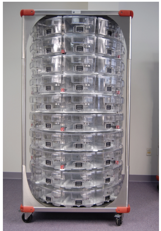
FIGURE 7 | Animal Caging Systems’s OptiMICE rack. The rack is a circular carousel of 100 cages that rotates on maintenance-free, low-friction bearings so that operators can access any cage in the unit from a single side. The rack does not have blowers, but instead relies on fresh or HEPA-filtered air from the HVAC system to deliver convection-assisted, low-velocity, one-pass air across its cages.

Monitoring and security components. Animal Care Systems’s biocontainment unit can be equipped with alarms. Also, the cages themselves are protected by a