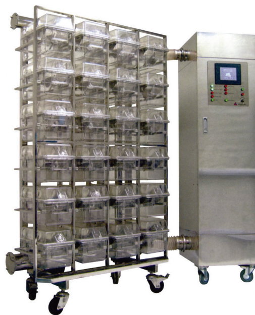
FIGURE 4 | Lenderking Caging Products's Micro-Safe biocontainment unit, which consists of a controller unit and up to three racks for a maximum of 280 total cages. The unit is depicted attached to one single-sided rack.