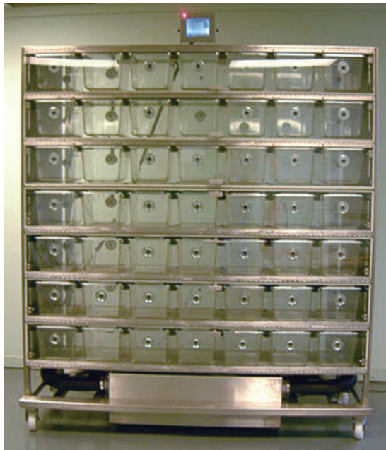
FIGURE 6 | BioZone’s system uses two independent levels of differential pressure to create ABSL-3 biocontainment. Each row of IVCs, for example, can be enclosed in its own independently ventilated pressure zone, allowing quarantine or laboratory facilities to separately house animals of different provenance in separate rows within the same rack without any risk of cross-contamination.

Monitoring and security components. All of BioZone’s IVC or MiniRoom systems monitor and control airflow, differential pressure, and filter conditions. These parameters are displayed on the DigiFlow touchscreen. Alarm contacts are also available to be connected to remote building management systems. Forty-eight hours of battery-powered backup is available for BioZone’s systems.