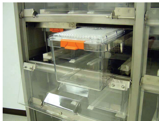
FIGURE 2 | Lab Products's Super Mouse 750 (483 cm 2 ). After the cage is inserted into the fully docked position, a hinged plate comes down in front of the cage for visual confirmation of proper docking. Two Super Mouse 750s can be replaced by one Super Mouse 1800. The different size cages can be mixed and matched on a single rack.

Ventilation and filters. Air is HEPA-filtered and flows into the cabinet air supply system. Once circulating inside the cabinet, the HEPA-filtered air is drawn through the cage filter-top and then evacuated through the airlock cage exhaust connection, then through a HEPA-filtered exhaust unit. The cage exhaust connection has a reusable filter that can be cleaned. Removing cages does not affect the cage airflow: the cabinet supply air replaces the same amount of air that is evacuated