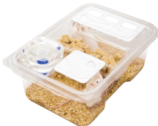
FIGURE 5 | Innovive's disposable IVC cage. The cages are irradiated and double-bagged to ensure sterility. Used cages are bagged under the hood, wiped down, and then autoclaved or incinerated. The cage lid snaps onto the cage bottom to form an airtight seal. Single-use HEPA filters in the lid secure the exhaust and supply ports.

Ventilation and filters. The Innovive cage lid snaps onto the cage bottom to form an airtight seal. Single-use HEPA filters in the lid secure both the exhaust and supply ports. The cage-level exhaust HEPA filters also protect a vent at the rear of the cage to ensure the animals will survive for at least 48 hours in case of power failure. A disposable adhesive gasket seals the interface between the cage and the water bottle.